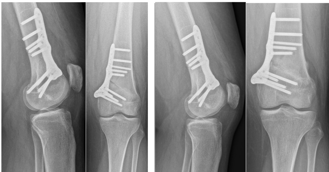
Postoperative X-rays : day 1 after surgery

At 3 months follow-up, the patient had a free range of motion without pain during full weight bearing.